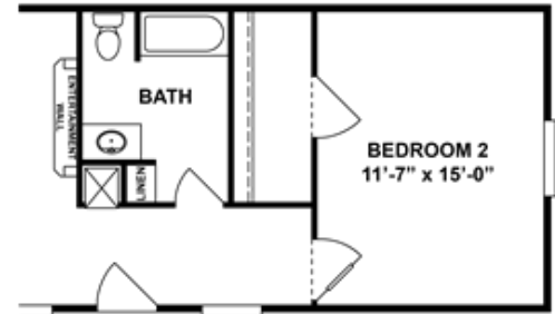
2 BEDROOM OPTION

Our home building facilities invest in continuous product and process improvements. Plans, dimensions, features, materials, specifications and availability are subject to change without notice or obligation. Renderings and floor plans are representative likenesses of our homes and may differ from the actual homes. We invite you to tour a Home Center near you and inspect the highest value in quality housing available or call (859) 623-9404 to speak with a Home Consultant. Copyright 2017, CMH. All rights reserved.