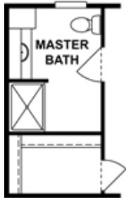
OPTIONAL 48" SHOWER BATH